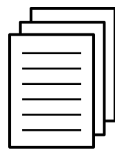
2017 Boarding Manual